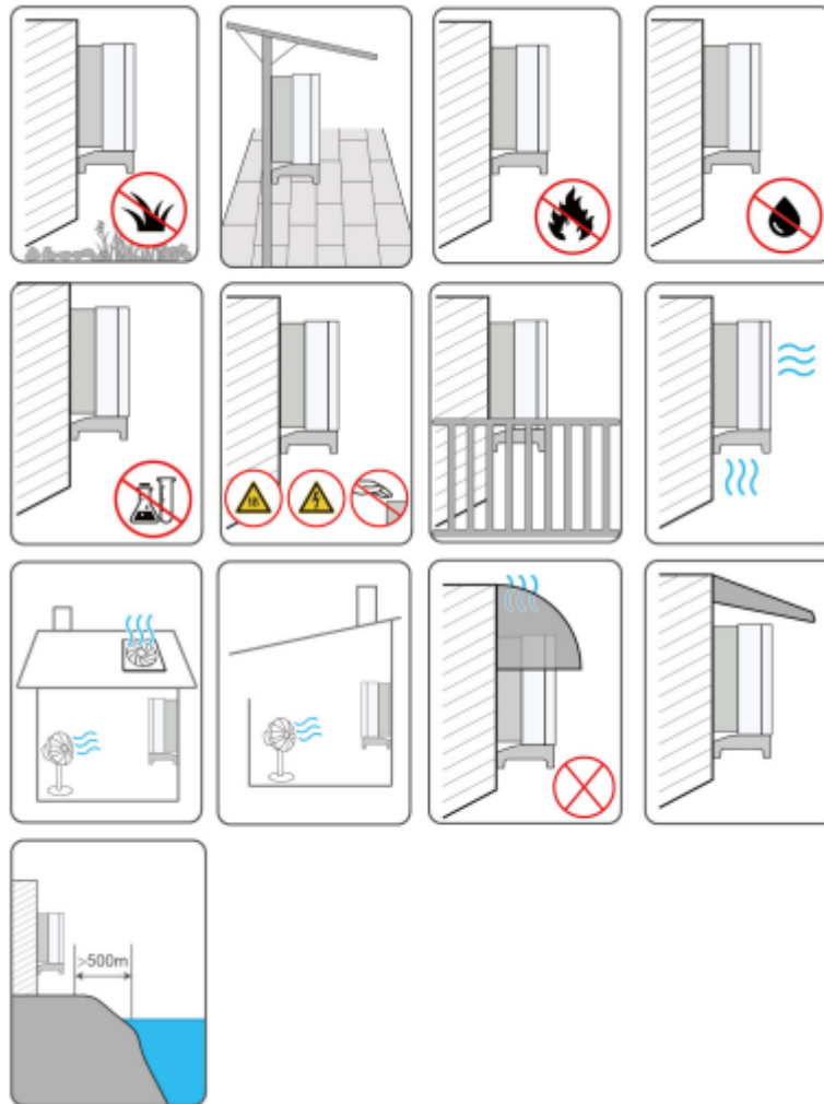
Extract from G3 user manual showing Installation requirements

If these are not followed, the inverter is unable to dissipate the heat as efficiently, and it may derate to prevent damage to itself or its components.