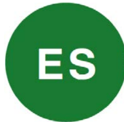
Figure 1 ES sign example in CEC standard

Label 1 Sign for energy storage adjacent to the meter box and main switchboard